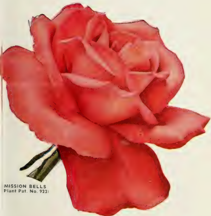
MISSION BELLS (Plant Pat. No. 923)